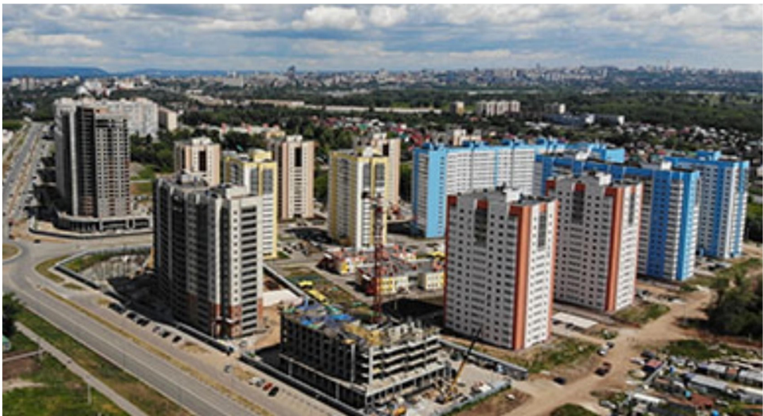
Figure 2. Residential buildings of the area under construction.